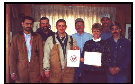
Randall Co. Feedyard employees accept Brand Mark certificate.

“Brand Mark” to feedyards who successfully complete the TCFA Annual Audit and Certification. To receive certification feedyards must effectively implement the Hazard Analysis and Critical Control Points (HACCP) and applicable Quality Control Points required by the TCFA Beef Safety and Quality Assurance Program SM .